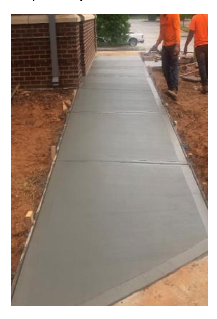
Figure 1 S. Atl – Final Sidewalk Pour