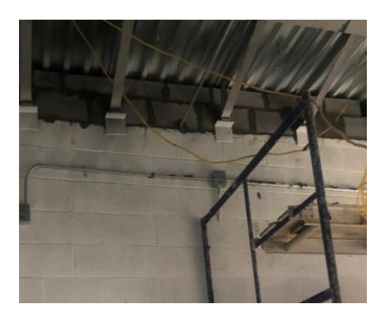
Figure 3 Carver – Topping out CMU